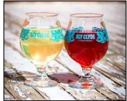
Featured Article - Funeral Home to Cidery, Learning About SlyClyde CiderWorks