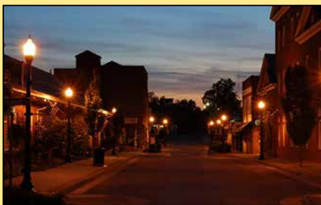
Main Street in Appomattox, Va at dusk.

Johnson Funeral Service dchapman@gmail.com