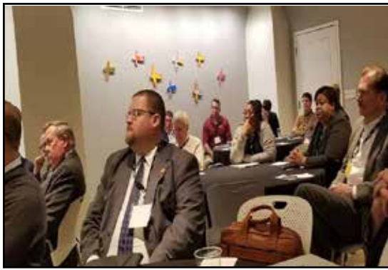
Virginia Funeral Directors Association hosted the Winter Conference at The Quirk Hotel in Richmond, Va.