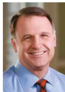
Senator Creigh Deeds SB1478