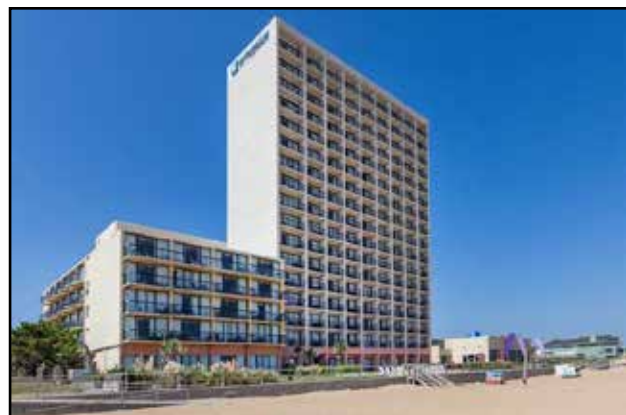
Join the VFDA at the 131st Annual VFDA Convention in Virginia Beach, June 16-19, 2019.