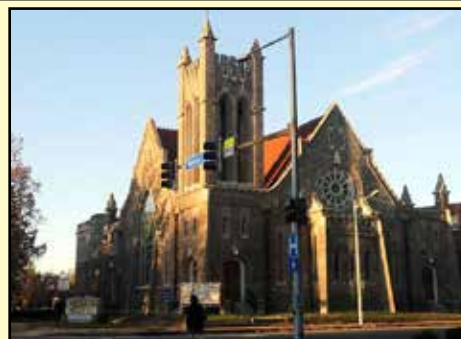
Freemason Abbey in Norfolk, Va.

H.D. Oliver Funeral Apt. digger9822@aol.com