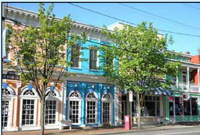
Main Street in Richmond, Va in the spring.

Meetings are held on the second Tuesday in January, March, May, July, September, and November. Installations in November.