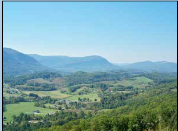
Powell Valley as viewed from Benges Gap in Norton, Va.

Meetings are held on the third Thursday in March, June, September, and December. Installations in June.