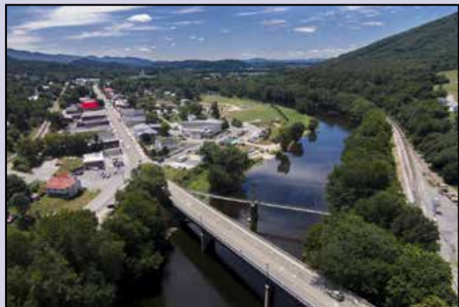
Beautiful Buchanan, Va in the Spring.

John M. Oakey, Inc jonathan@johnmoakey.com