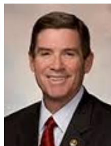
Senator John Cosgrove SB1493 & SR84 (SB1493 rolled into SB1439 ; McClellan)