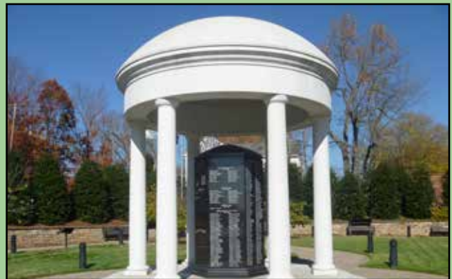
War Memorial in Halifax, VA.

Powell Funeral Home, South Boston lespowell111@gcronline.com