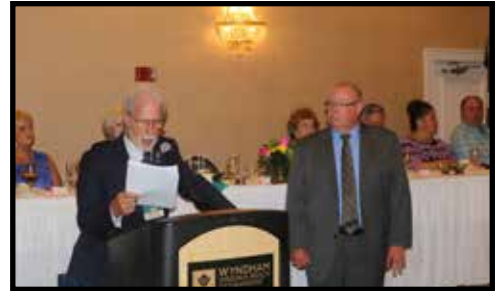
2019 VFDA Past President Council Scholarship Recipient Learn how you could be the 2020 Recipient on page 15.