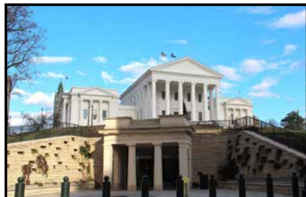
Join the VFDA at the annual VFDA Winter Conference January 26-27, 2020