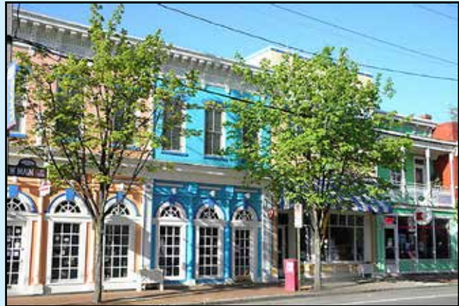
Main Street in Richmond, Va in the spring.