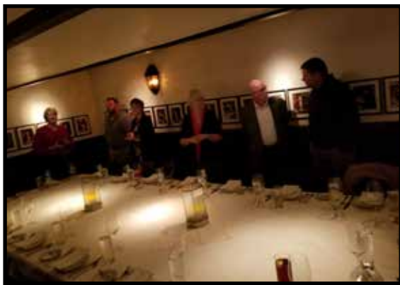
Virginia Funeral Directors Association members enjoyed dinner in Chicago at the NFDA Convention and Expo in October.