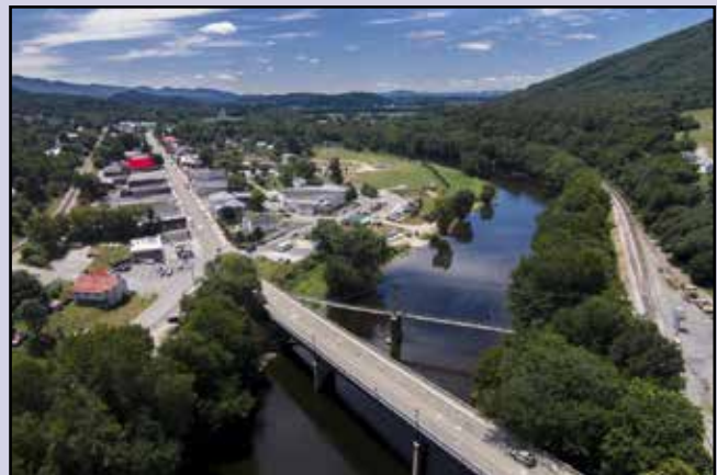
Beautiful Buchanan, Va in the Spring.

Meetings are held on the third Tuesday in January, March, May, July, and September. Installations in July.