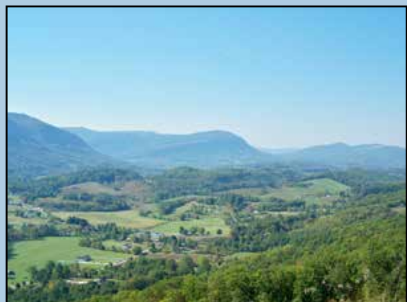
Powell Valley as viewed from Benge's Gap in Norton, Va.

Hagy & Fawbush Funeral Home Inc. info@hagyfawbush.com