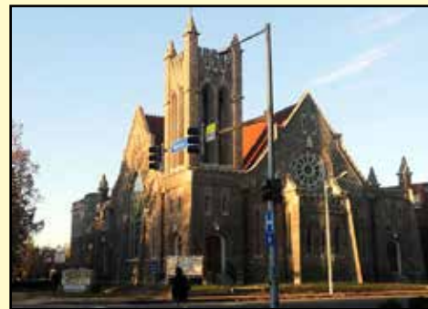
Freemason Abbey in Norfolk, Va.

H.D. Oliver Funeral Apt. digger9822@aol.com