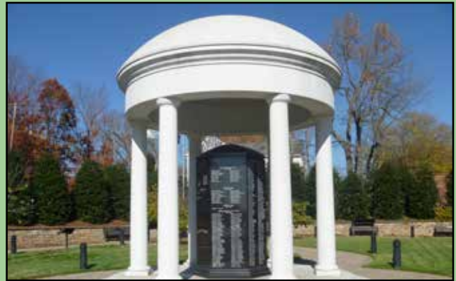
War Memorial in Halifax, VA.

Powell Funeral Home, South Boston lespowell111@gcronline.com