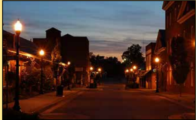
Main Street in Appomattox, Va at dusk.

Meetings are held on the third Thursday in January, March, May, September, and November. Installations in May.