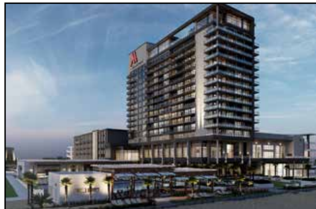
Join the VFDA at the 132nd Annual VFDA Convention in Virginia Beach, September 8-11, 2020.