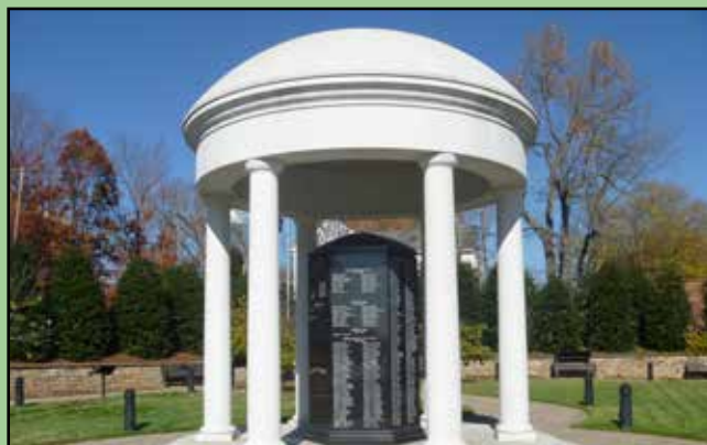
War Memorial in Halifax, VA.

Powell Funeral Home, South Boston lespowell111@gmail.com