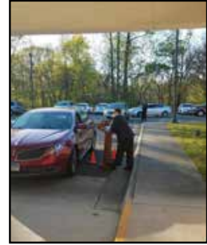
Heritage Funeral Home Drive Thru Visitation