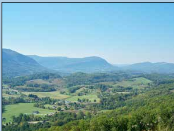
Powell Valley as viewed from Benge's Gap in Norton, Va.

Meetings are held on the third Thursday in March, June, September, and December. Installations in June.