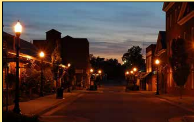
Main Street in Appomattox, Va at dusk.

Johnson Funeral Service dchapmanp@gmail.com