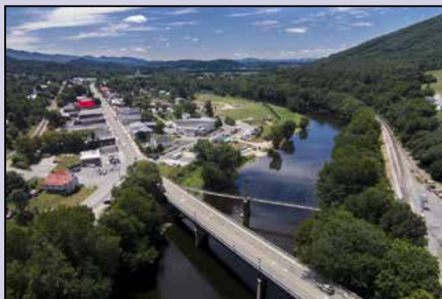
Beautiful Buchanan, Va in the Spring.

Meetings are held on the third Tuesday in January, March, May, July, and September. Installations in July.