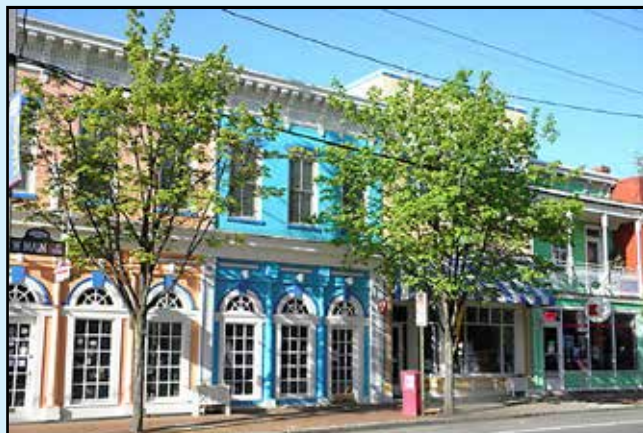
Main Street in Richmond, Va in the spring.