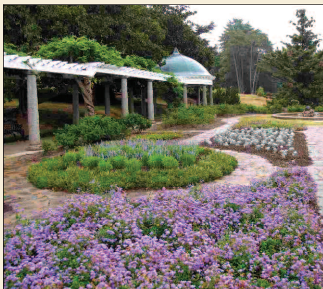
Maymont Gardens, Richmond

Meetings are held on the 2nd Tuesday in January, March, May, July, September and November.