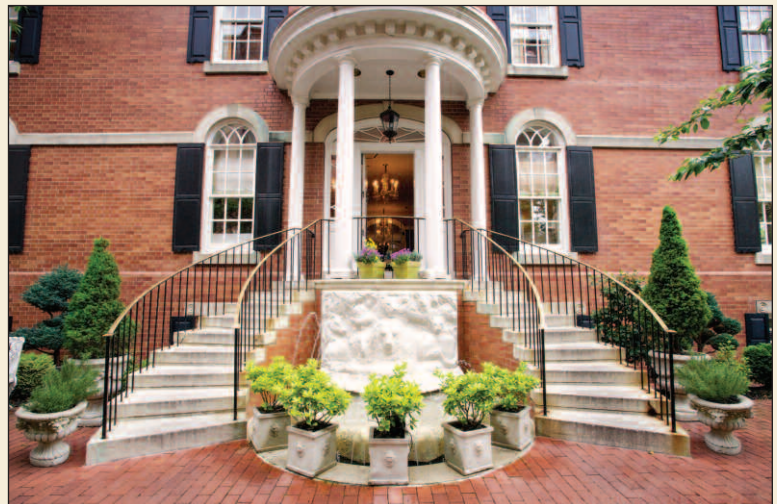
Morrison House, Alexandria