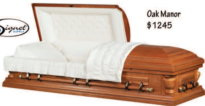
Oak Manor $1245

Solid oak casket with almond velvet interior.