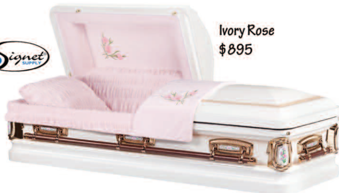
Ivory Rose $895

18 Gauge Steel casket with pink velvet interior.