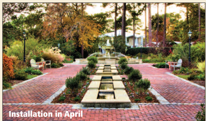
Norfolk Botanical Gardens